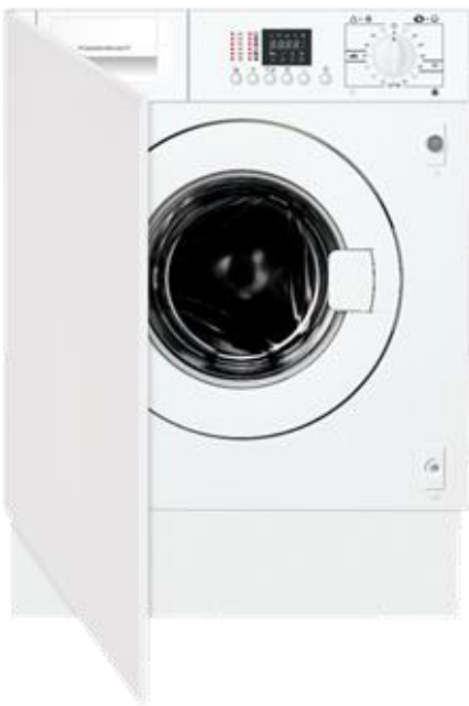
WT 6800.0i Built-in Washer Dryer